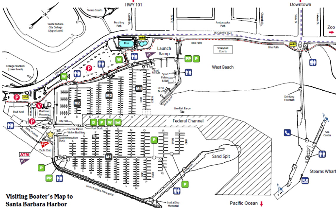
Visiting Boater's Map to Santa Barbara Harbor