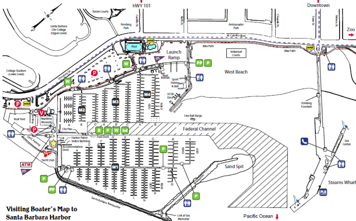
Visiting Boater's Map to Santa Barbara Harbor